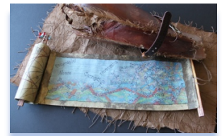
Digitally and Handmade Scroll