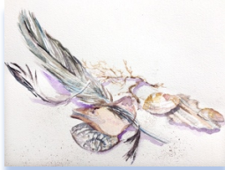
Sketchbook as Journal