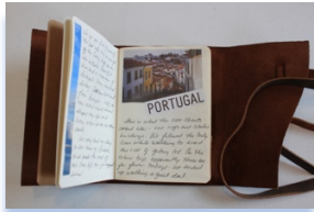
Travel Journal with Scrapbooking